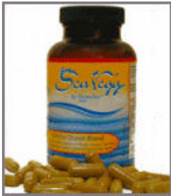
Sea Vegg Scott Kennedy

Check out all of our natural health products